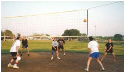
2 Volleyball Courts